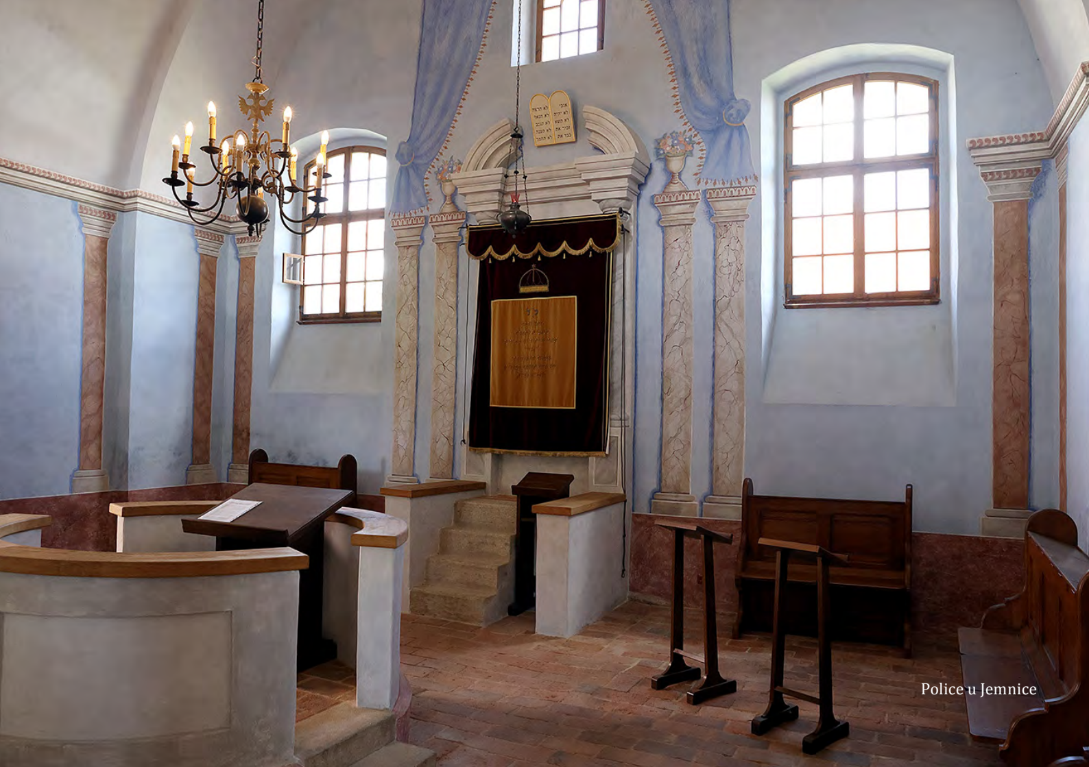
Police u Jemnice